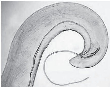
Figure 1. Caudal end Thelazia male

male worms had five pairs of postcloacal papillae on the ventral side of the body. The distance from the position of the cloaca to the end of the tail ranged from 69-81 \mu\text{m} . Right spicule was shorter and its length ranged from 141-150 \mu\text{m} . Left spicule was much longer, ranging from 1.433-1.757 mm. In female worms, vulva was situated anterior to the oesophago-intestinal junction, and the distance between the vulva and buccal extremity ranged from 557-639 \mu\text{m} in length.