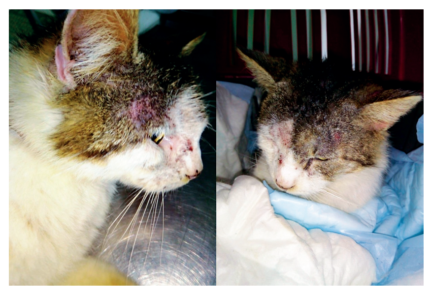
Figure 1. Pruritic head lesions in a household cat (original photos)

Due to intense pruritus, scales and crusts on the face, ear pine, head and front legs were observed. Pruritus was intense in the periocular area so that the eyes were sometimes closed during the episodes of scratching and consequent self/mutilation dermatitis. The reactive skin on the head was hyperkeratotic, hyperpigmented/grey of scabby appearance (Figure 2).