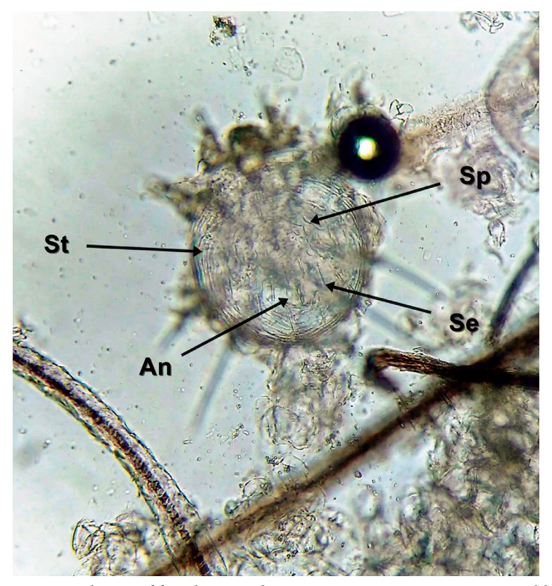
Figure 4. Dorsal view of female Notoedres cati ; An – anus; Se – setae; Sp – "blunt" spines; St – 'finger-like' striations (original photo)

At the dorsal surface, the idiosoma had concentric, fingerprint-like striations (St), the anus surrounded by blunt spines (Sp) and dorsal setae (Se) (Figure 4). According to the morphological and morphometric examinations (Bowman, 2008; Klompen, 1992) the definitive diagnosis was Notoedres cati .