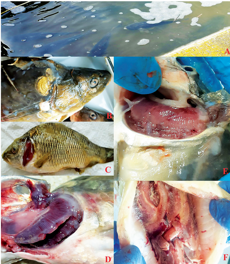
Figure 3. External examination and gross pathology of the carp: A) Lethargic behavior with reduced food intake; B) Overproduction of mucus on skin; C) Secondary bacterial and fungal gill and skin infections; D) Overproduction of mucus on gills; E) Pale swollen gills, sometimes with irregular discoloration and gill necrosis; F) Fibrinous peritonitis.

During CEVD outbreaks, no behavior changes or clinical signs of disease were noticed in other fish species present in the same pond with carp. Most outbreaks occurred between late spring and early summer, when water temperature was between 14 °C and 25 °C. But, in a few cases, the occurrence of the disease with mortalities was noticed in autumn and early spring when temperature was just 7 - 12 °C (Table 1). The highest mortality rates were recorded during an outbreak at the beginning of May (with water temperature of 18 °C) and during three outbreaks in September (water temperature 21 °C and 22 °C) (Table 1). Various clinical signs of the disease were observed in CEV positive carps (Figure 3).