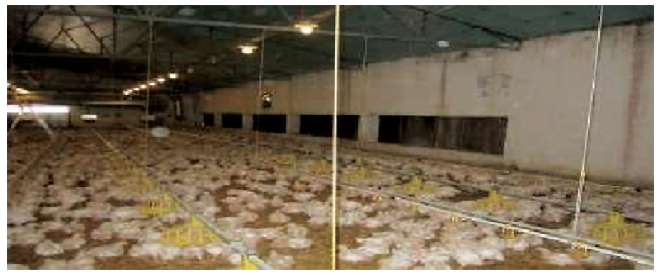
Figure 6. Proper distribution of chickens in the poultry house

through skin contact with cooler surfaces. Dry and loose litter enables the poultry to reach the cold floor beneath and lay down on it. Floor cooling operates similar to floor heating, in which cold water flows through the underfloor pipe system during the summer. The combination of underfloor cooling and tunnel ventilation system is highly effective and most promising solution. Some of its basic advantages are: the system is relatively cheap, easy to maintain and energy-saving. It should be emphasized that the system does not increase the air humidity in the poultry house. As compared with the systems known so far, combined cooling systems proved highly effective in terms of improving the production performances in poultry industry, and statistically significant differences were reported ( Donald et al., 2000 ).