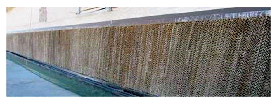
Figure 2. Evaporative pad cooling system

Pad cooling systems are installed on the air inlet openings and provide cooling by air flowing into the house through the pad moisten with cold water. Evaporative cooling pads are currently the most effective and efficient systems for cooling poultry houses and is installed at many farms. (Figure 2)