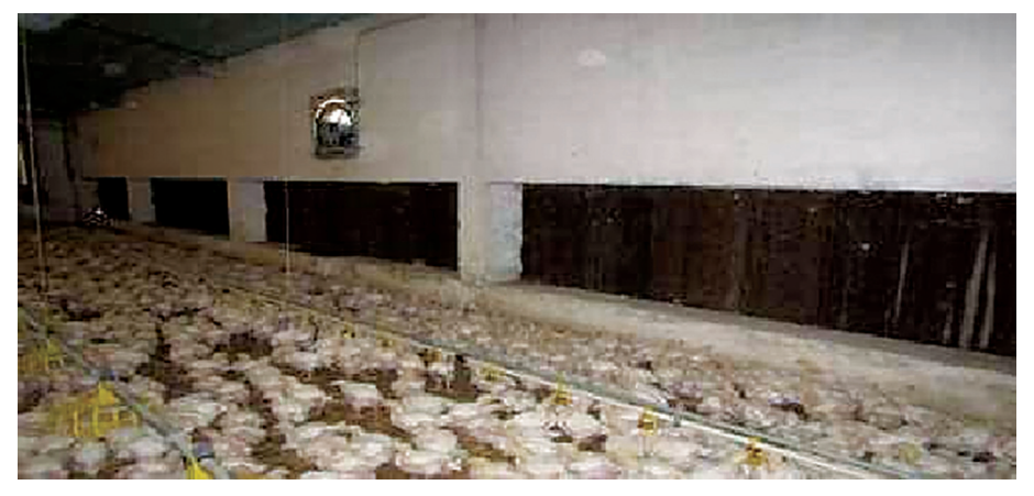
Figure 4. Grouping of chickens near the pads toward the cool place

air speed (minimum of 500 m on the foot; 600–700 m per minute is better), there is little benefit to running pads before about 82–85 °F (27.77-29.44 °C) ( Dozier et al., 2005 ). Running the pads likely is counterproductive in terms of ambient conditions, production performances and overall health status of the flock ( Campbell et al., 2006 ). Pad cooling system is complementary with tunnel ventilation and relies on the large volume of airflow produced by tunnel fans, which improves sensible heat release from the birds ( Donald et al., 2000 ; Donald, 2000 ). To ensure proper functioning of a pad cooling system, it is important not to install sensors near the pads (Fig. 4), as this will tend to increase the possibility of pads coming on at too high a temperature for birds in the tunnel fan end (Fig. 5).