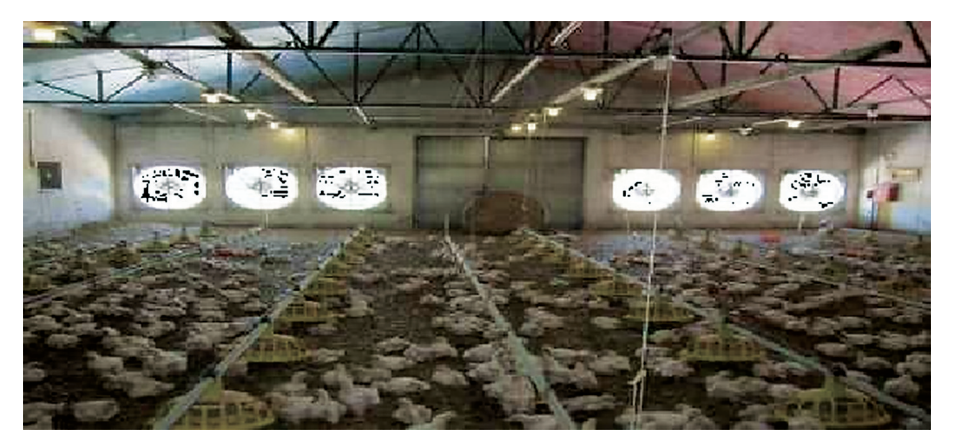
Figure 5. Reduced number of chickens at the end of the tunnel because of high temperature